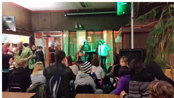
Friday night Open Mic at The Overflowing Cup (JOSHIAH'S Place Coffeehouse)