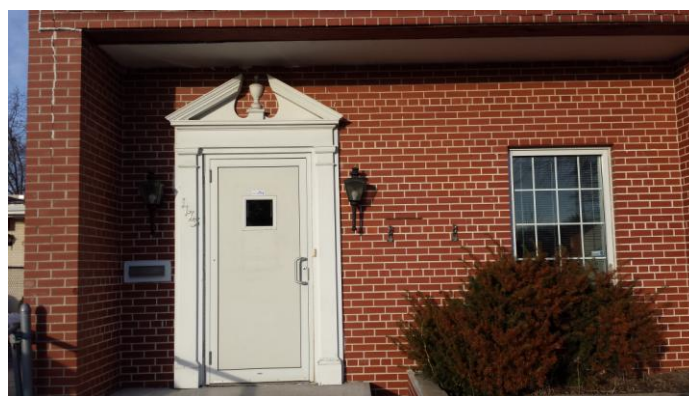
Front entrance of our new location at 1175 Madison Road in Beloit